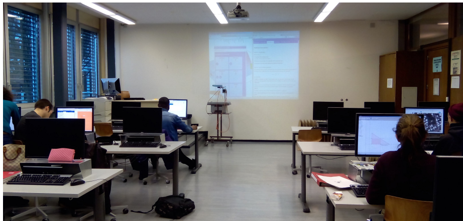
Fig. 3: Awareness information displayed for Alice and students during the first study.

Learning Process. In the two studies carried by Alice, the students were allowed to work individually or in groups. Since Alice was not nearby her computer, she displayed the monitoring apps using the projector, so teacher and students could see the visualizations as presented in Figure 3. She walked around, answering the questions that emerged during the learning activity. After answering the questions, Alice had a look to the apps and, according to the student distribution across inquiry phases , chose the next group to visit. At the same time, the students periodically observed the apps to compare their own progress with that of their peers. In the case of Bob, the students worked in groups of 2 to 3 sharing one computer. Since he could access the students' screens from his computer, he controlled the situation from his desk, going to the students just when the students had doubts. Bob mainly used the visualization of the active users per phase to monitor whether the students were using the ILS or not, and to be aware of the current phase where they were working on (see Figure 4). Although both teachers had designed the ILSs to be used in 90-minute, face-to-face sessions, they were also used at home because some students could not attend to the school and others did not finished the activities on time. Thus, they wanted to monitor the on-line work.