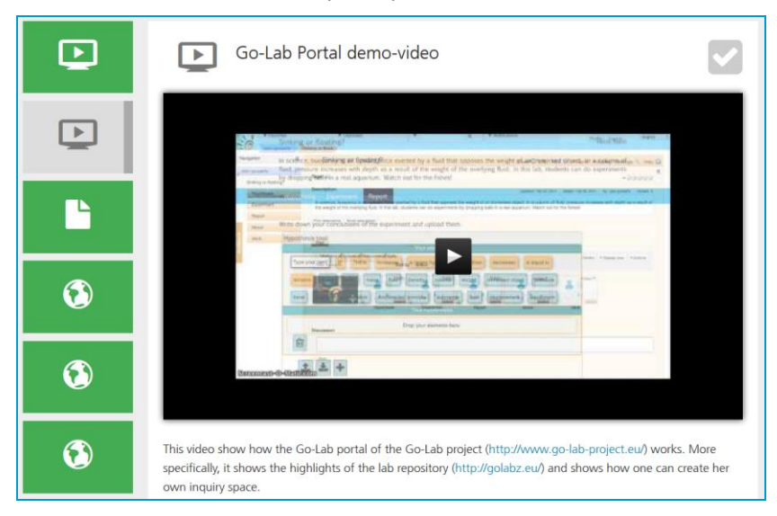
Fig. 1: Course module at the OpenCourseWorld platform

The OpenCourseWorld platform is the main entrance to the MOOC, where the teachers can register for the course, study the course materials, and obtain the certificates after the course is completed. Here, the learning modules containing video and reading materials as well as the links to additional learning resources are presented. Figure 1 demonstrates how such course module looks like. On the left side of the screen, a menu listing the course materials (each type of material denoted with an icon) is represented. On the right side, selected learning resource is displayed. The tick box in the right upper corner of the screen allows the course participant to mark the resource as "studied".