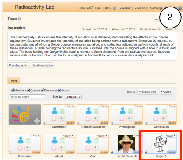
Fig. 1. (1) AngeLA is invited to become a member of the "Radioactivity Lab" space in Graasp. (2) AngeLA is a member of the space.