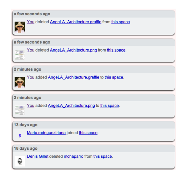
Fig. 3. A sample stream of user activities in a space.

Tracking Permissions UI. AngeLA aggregates user activities only from the learning spaces where it is a member. This provides an easy-to-use and familiar manner to manage privacy: (i) to enable the activity tracking in a space the teacher