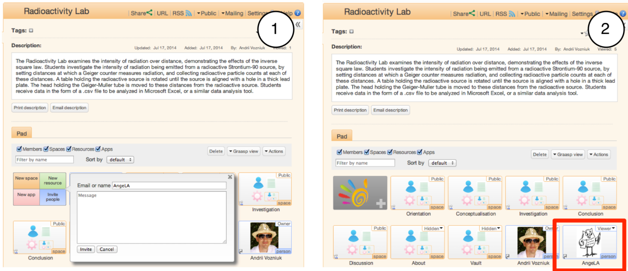
Fig. 1. (1) AngelA is invited to become a member of the “Radioactivity Lab” space in Graasp. (2) AngelA is a member of the space.