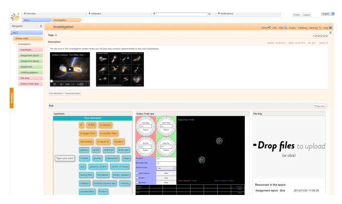
Figure 1: User interface of the ILS editor .

During the lecture, the teacher shares the secret URL of the ILS with her students. Then, each student accesses the secret URL, which opens the ILS student view , as illustrated in Figure 2. After providing a nickname in the pop-up window, each student can log in and perform the experiment according to the teacher's instructions.