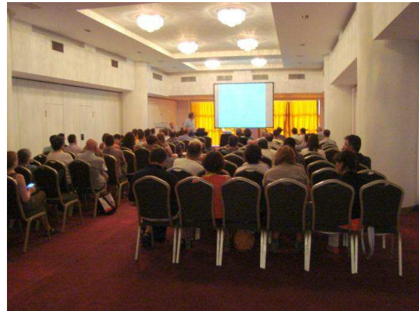
Figure 2. Plenary session “Science Created by You” by Prof. Ton de Jong

During the workshops participants worked on the activity they had prepared beforehand (Prior to the beginning of the summer school all participants had received detailed guidelines on how to create an inquiry based learning activity) with the aim to refine it and add some more digital material to make it more interactive and interesting for students. To achieve that, they were introduced to repositories of digital educational material and online labs. The tutors worked with each of the participants in person, discussing their activity and proposing improvements and extra material. During the workshops, participants also had the opportunity to use some online labs and perform small tasks. Throughout the course, teachers enjoyed hands-on activities with three online labs; the Faulkes network of robotic telescopes, and the SalsaJ image analysis tool, the Crashing Galaxies applet and the HYPATIA analysis tool. During the last workshop, all participants uploaded their activities to an educational repository. Likewise, in future summer schools participants will be able to upload their activities to the Go-Lab repository.