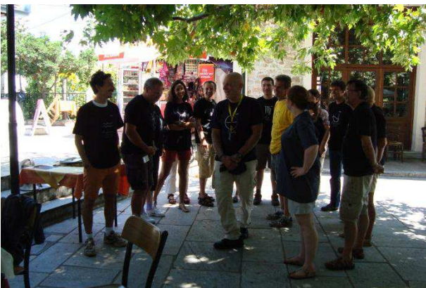
Figure 4. Science café at Milies Village

Field trips and extra activities were also carried out during the course. These initiatives included an observation of the night sky at the mountain Pelion, a science café event at the village of Milies, a virtual visit to the control room of the ATLAS experiments at CERN and a visit to the archaeological Museum of Volos. These activities greatly contribute to the effectiveness of the interaction between teachers and increase the chances of collaboration between them after the completion of the course.