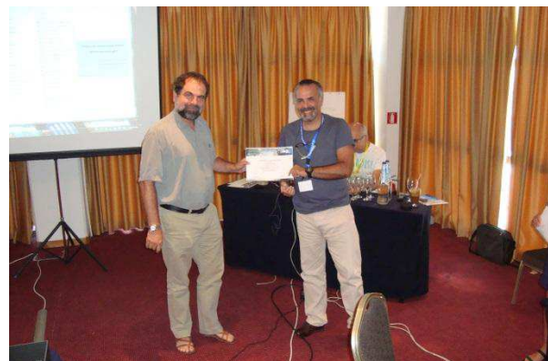
Figure 5. Participants' presentation

The detailed programme of the course, as well as descriptions of the events, are presented below.