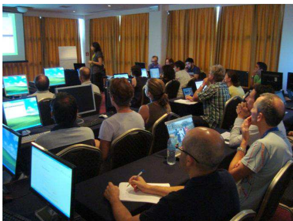
Figure 1. Workshop on the “Crashing Galaxies” activity

Throughout the course of the project, the consortium can organize international training courses in the form of summer schools and winter schools in different countries in order to train the teachers who will be involved in the pilot phases of the project. These summer and winter schools can be a very effective way not only to train teachers properly but also to increase the collaboration between them.