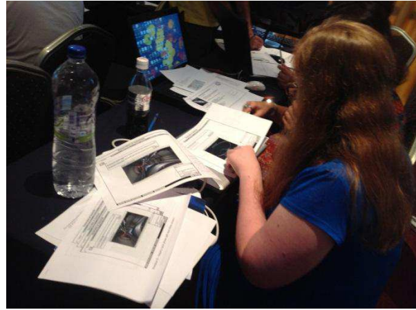
Figure 3. Go-Lab participatory Design workshop

Field trips and extra activities were also carried out during the course. These initiatives included an observation of the night sky at the mountain Pelion, a science café event at the village of Milies, a virtual visit to the control room of the ATLAS experiments at CERN and a visit to the archaeological Museum of Volos. These activities greatly contribute to the effectiveness of the interaction between teachers and increase the chances of collaboration between them after the completion of the course.