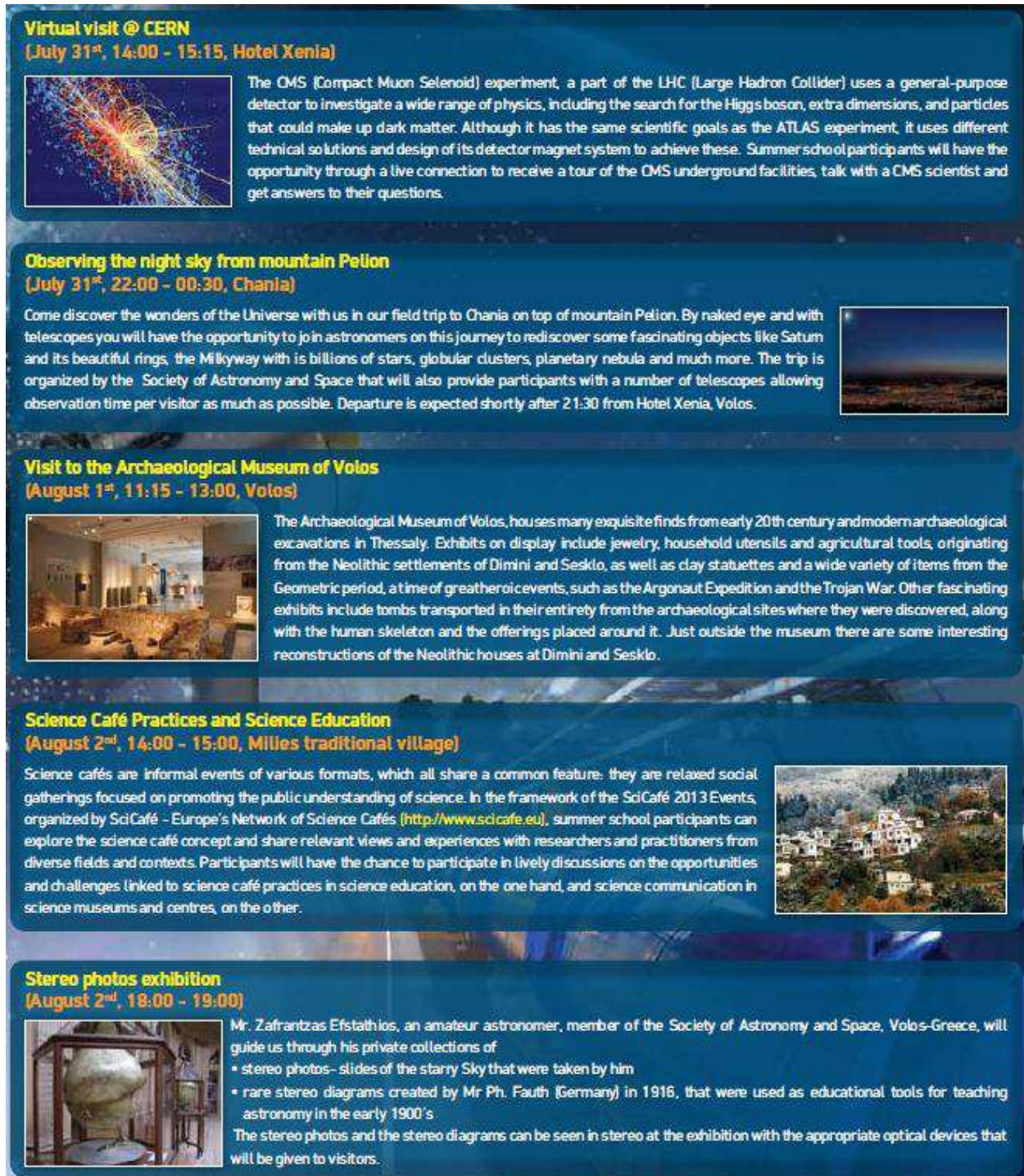
Figure 7. Descriptions of the events carried out