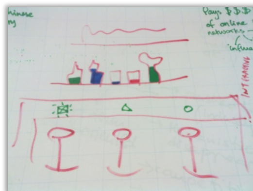
Figure 3 "Smart bar" in 2020, fostering social networking for informal learning

The bar of the hotel was always a place to meet and socialize, especially for the business travelers usually staying there (see Figure 2). Amelie's idea to take advantage of existing social platforms and the information that they keep in relation to the interests and activities of the members (something like the ancient LinkedIn platform that was popular a decade ago), in order to build a really interactive space, that would connect visitors with their peers that are visiting the hotel, suggest collaborations based on mutual interests or simply recommend joining someone for dinner or a drink - always on a strictly business dating context.