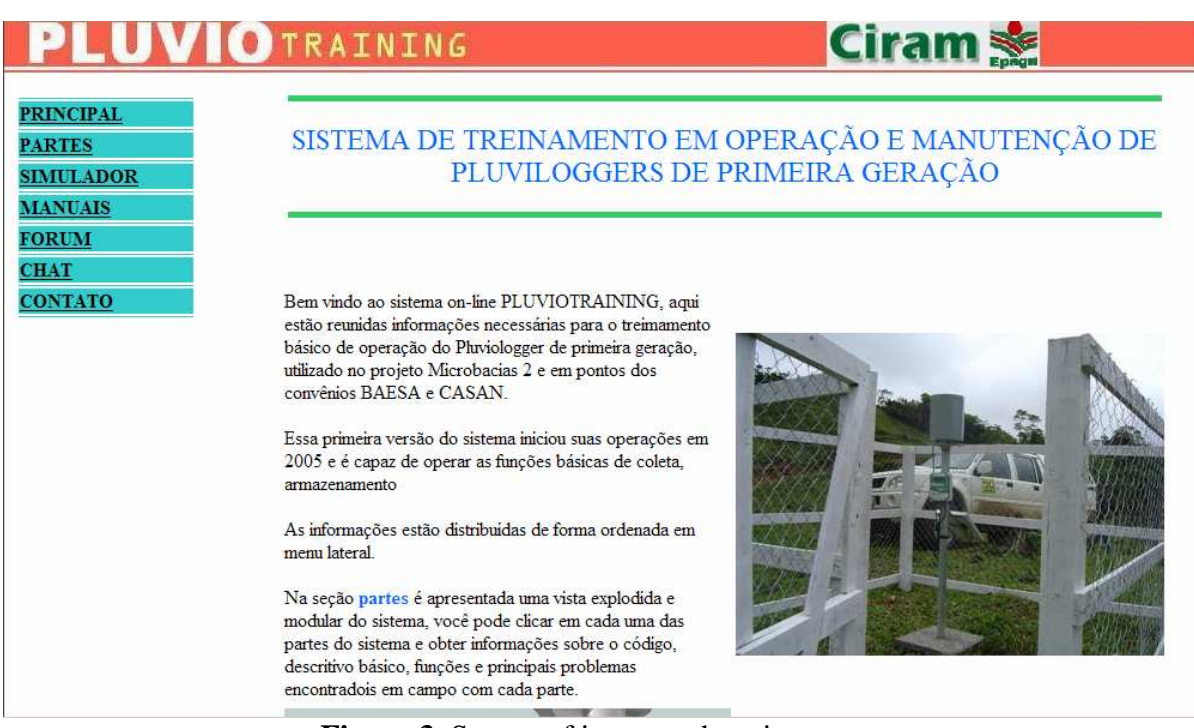
Figure 3. Screen of integrated environment.