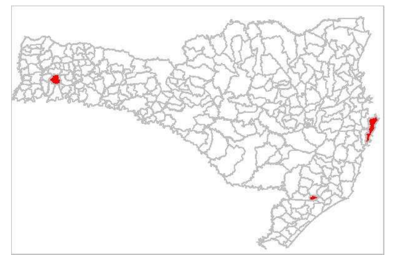
Figure 1. Starting point of maintenance teams in the State of Santa Catarina.

Epagri have agreements with several institutions in the State of Santa Catarina that guaranteed the installation of 50 Pluviologgers in an area of 95.442 km<sup>2</sup>. The equipment demands monthly preventive maintenance, what makes impracticable the use of only one maintenance team due to the fact that the Headquarters of Epagri is situated in the Capital (extreme east of the State). Currently three teams are responsible for the maintenance of all equipment, which are distributed according to the Figure 1.