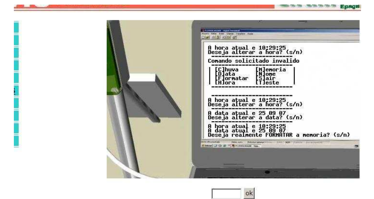
Figure 5. Simulator environment.