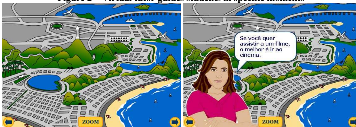
Figure 2 – Virtual tutor guides students in specific moments

The animated pedagogical agents were developed with Adobe Macromedia Flash© software and interact with students with text and audio messages in a proactive way. Besides the characters integrated in the main role-playing story, a virtual tutor guides them within the courses’ content along the scenario (Figure 2).