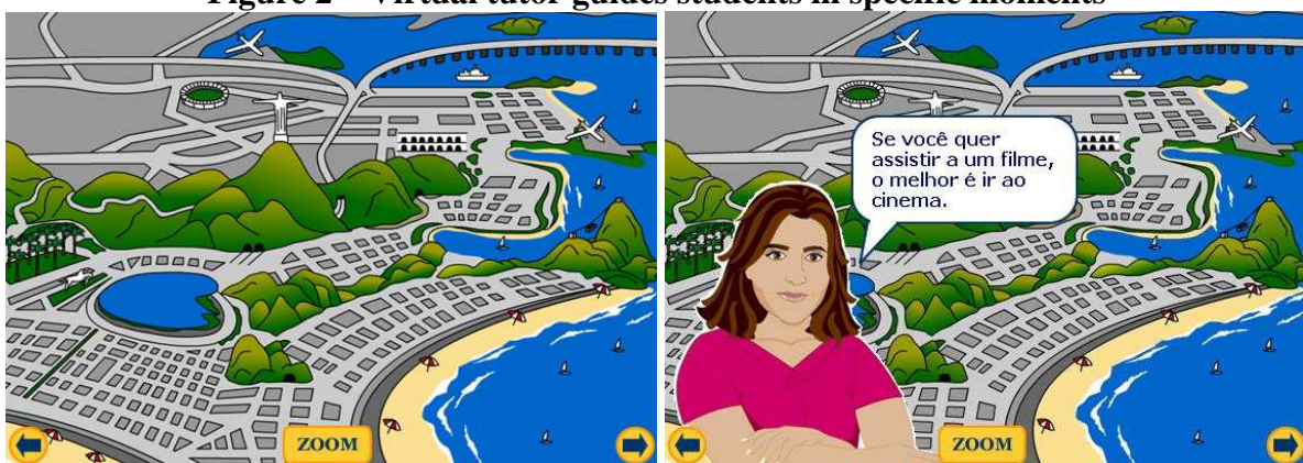
Figure 2 – Virtual tutor guides students in specific moments

The animated pedagogical agents were developed with Adobe Macromedia Flash© software and interact with students with text and audio messages in a proactive way. Besides the characters integrated in the main role-playing story, a virtual tutor guides them within the courses’ content along the scenario (Figure 2).