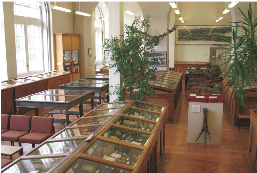
Figure 1: Main Hall of the Lapworth Museum of Geology, University of Birmingham

The Lapworth Museum of Geology at the University of Birmingham is one of the pre-eminent geology museums in the United Kingdom. Established in 1880, its collections now number around 250,000 specimens, with particular strengths in vertebrate and invertebrate palaeontology and mineralogy. The collections are characterised by having a particularly large volume of supporting historical information (e.g. documents, photographs and maps), that is housed in the museum's archives. As shown in Figure 1, the principal display area for the collections is the Main Hall of the museum. The Lapworth Museum of Geology is one of only two geology museums in the UK to retain its original Victorian/Edwardian design and fittings.