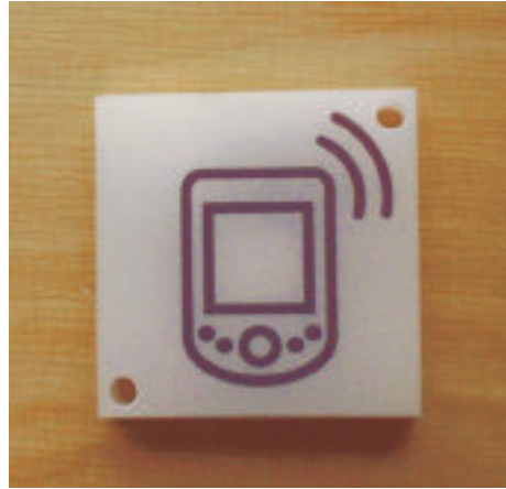
Figure 2: A Sample Magus Guide Tag

application. As the tags had a read distance of approximately 1 metre, it was possible to place them inside the display cases. In total, 17 of these tags were acquired for this study.