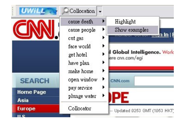
Figure 1. Toolbar's dropdown menu with detected collocations and link to examples

Similar to the first iteration in our chunk detector, Collocator takes as collocation candidates all possible pairings of POS-specific words (x and y above) in which the two words appear within a five-word window of each other in our 20 million-words of running text of the BNC. Using the above measure, each x,y ordered pair yields a word association score. Collocations are word pairs that show a sufficiently strong word association between the two words in the pair. Thus, a minimum score threshold is used to select which of the candidate word pairs constitute collocations. This threshold can be lowered or raised to adjust the agent's precision and recall. The collocation knowledge thus extracted from our POS-tagged BNC feeds our browser-based Collocator, enabling it to detect and highlight collocations that appear in the web pages that the user browses (See figure 1).