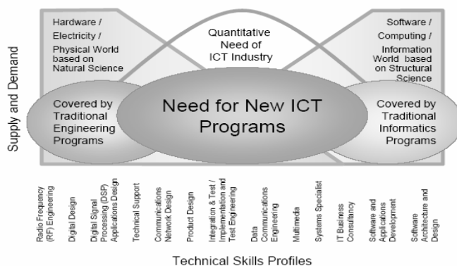
Fig.1. Need for New ICT Programs

An other important issue is focusing on Personal & Business Skills. Industry is seriously concerned that universities do not give enough attention to personal and business skills in their current ICT curricula, [5].