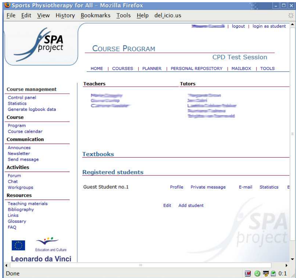
Figure 2: Page of a course in the SPA Educational Portal