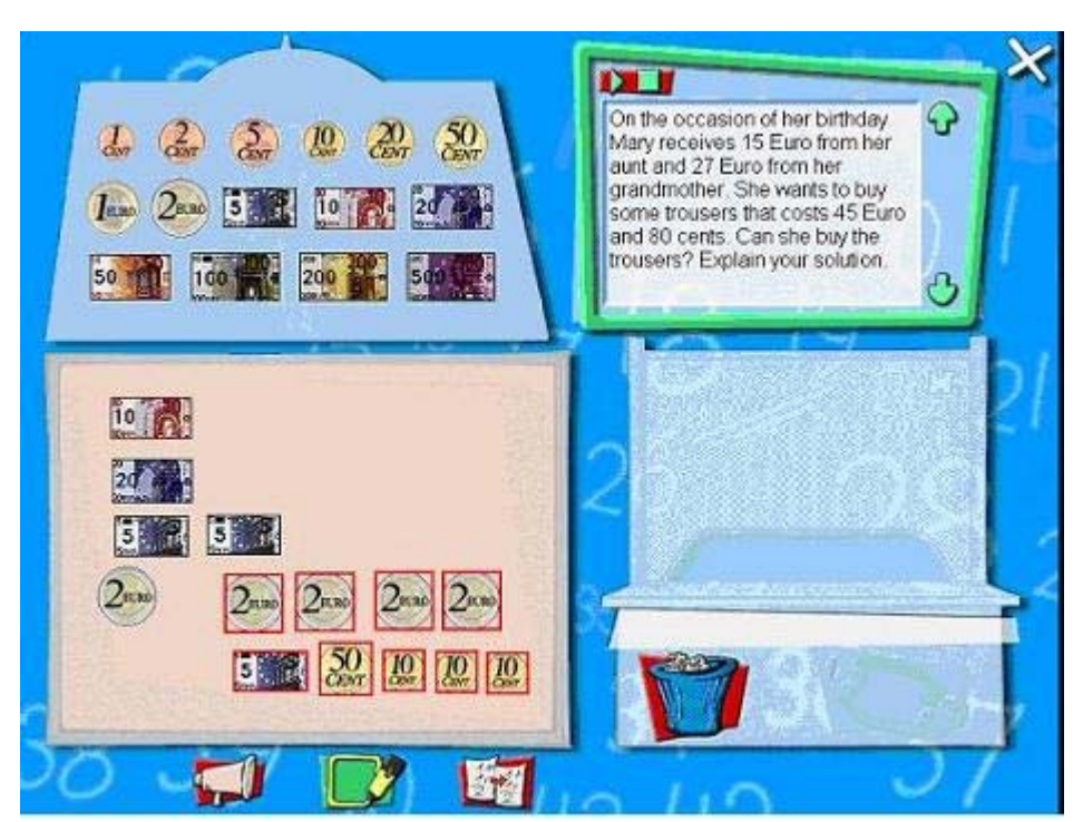
Figure 1. Interface of the Euro Microworld with an example of interaction

Some microworlds (such as Euro or Calendar) were designed to model common everyday situations such as 'buying and selling' or 'time' problems. For example, to solve a problem involving counting days, students can enter the Calendar microworld and visualise a month, mark intervals of days, pass from one month to another, etc. Similarly, to solve a problem involving a money transaction students can enter the Euro microworld and generate Euros to represent a given amount, move coins on the screen, change them with other Euro coins or banknotes of an equivalent value, etc. Figure 1 shows the interface of the Euro microworld with an example of interaction.