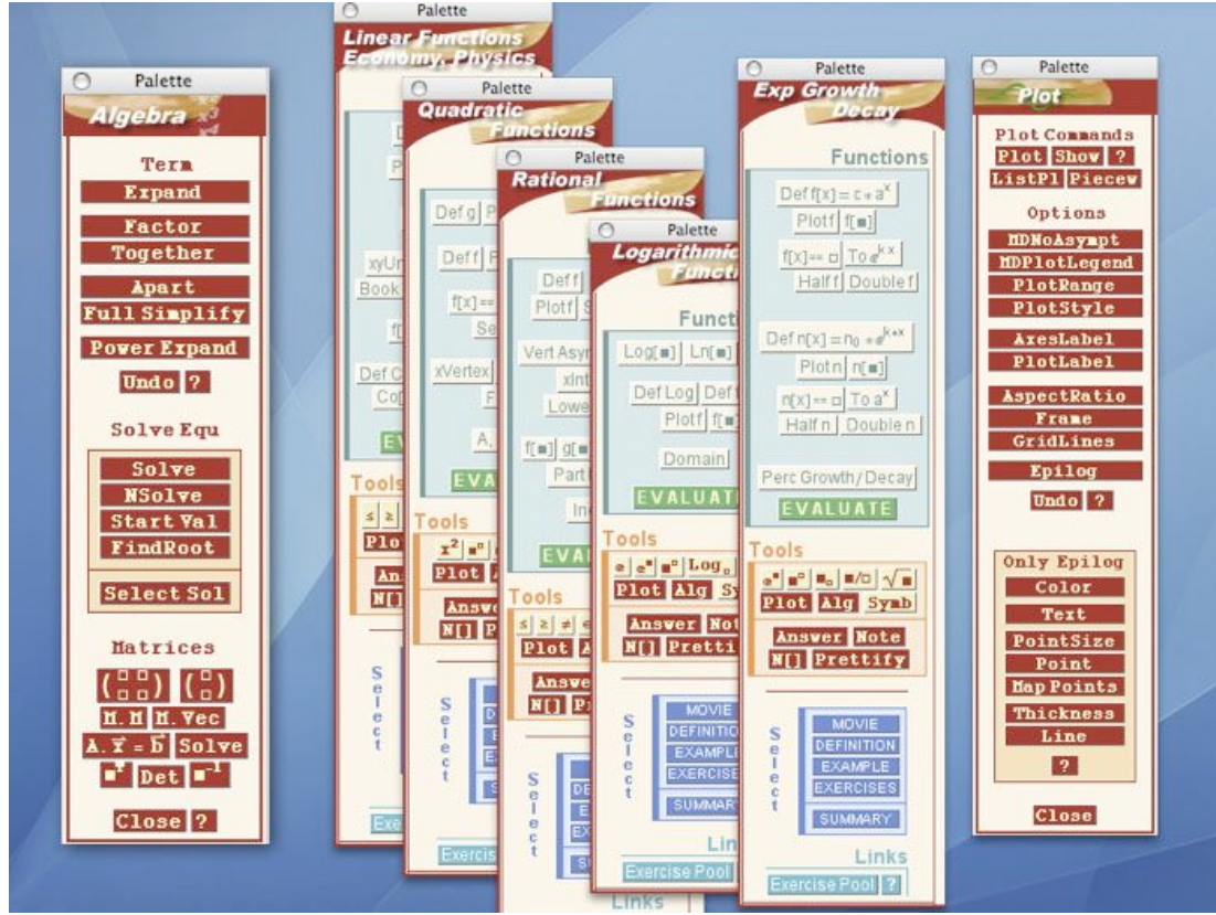
Fig. 1: Some LTM palettes in Mathematica.

A button on a palette typically pastes the template of a Mathematica command at the insertion point in the current notebook. For example, the button "Plot" (on the Plot palette) generates the following character string