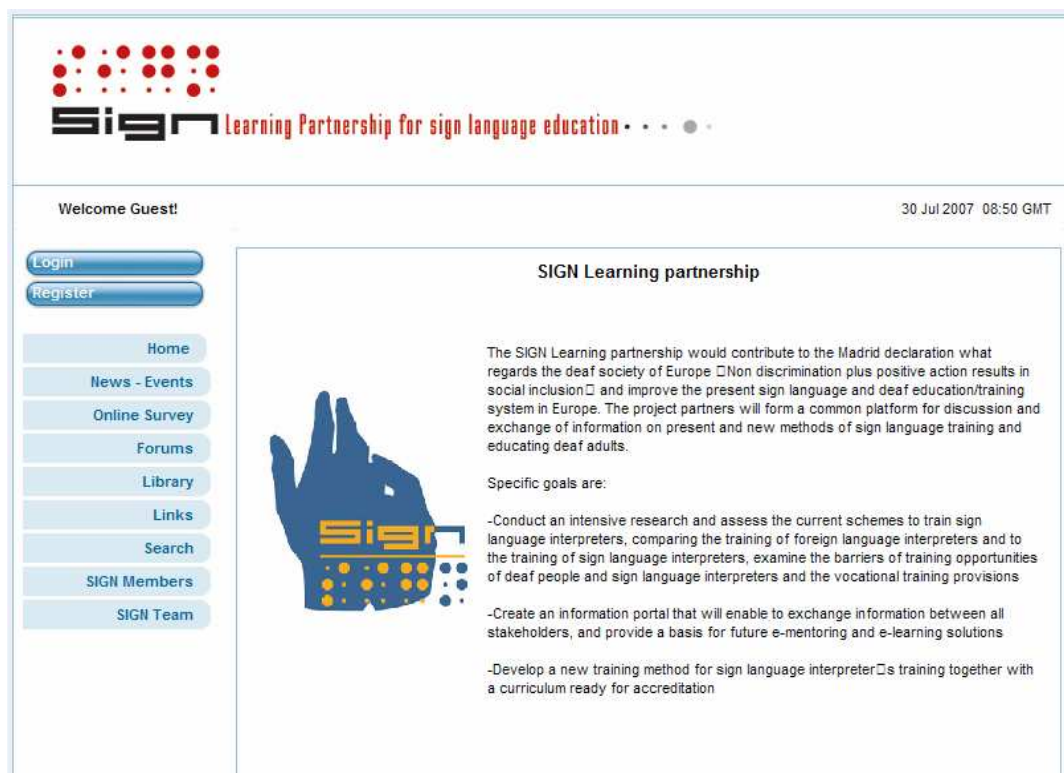
Figure 2: SIGN Learning Partnership Portal

Figure 2 provides an overview of the SIGN portal [6].