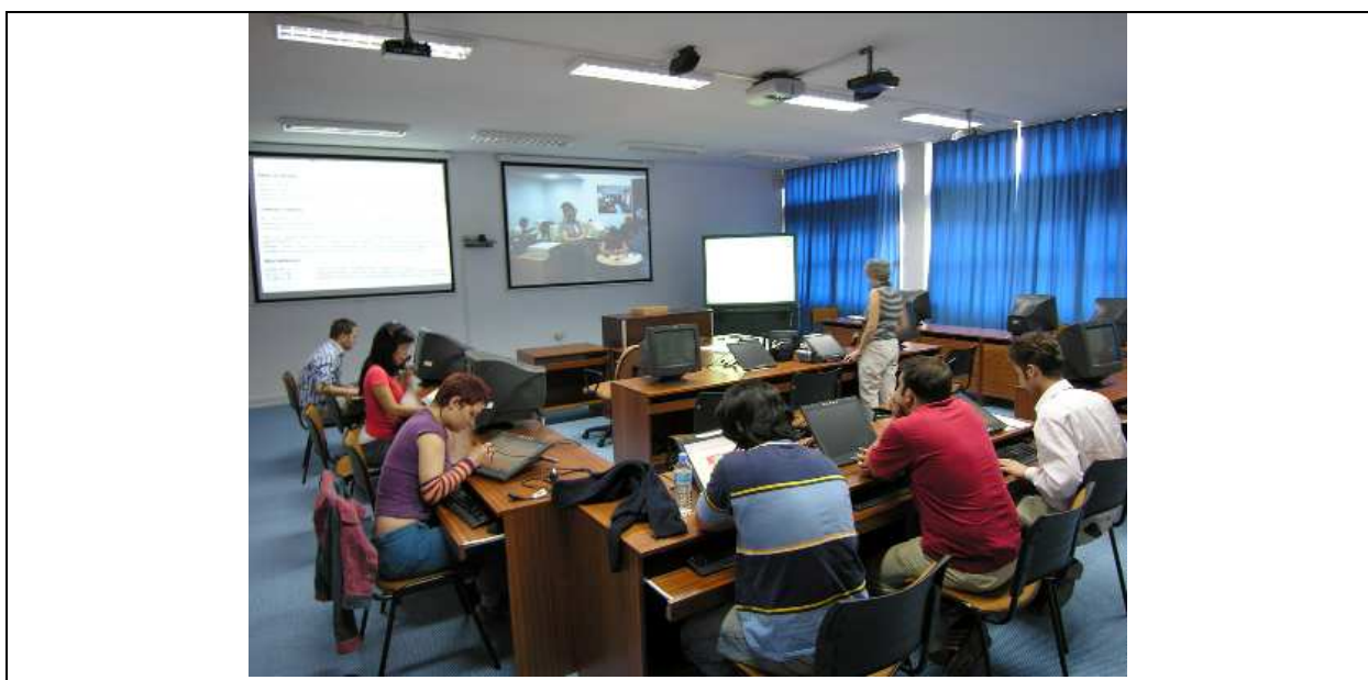
Figure 2. E-Design workshop: a syncronous design process.