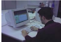
Laboratory room 2