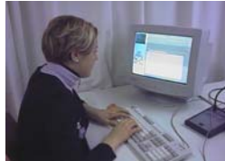
Laboratory room 1