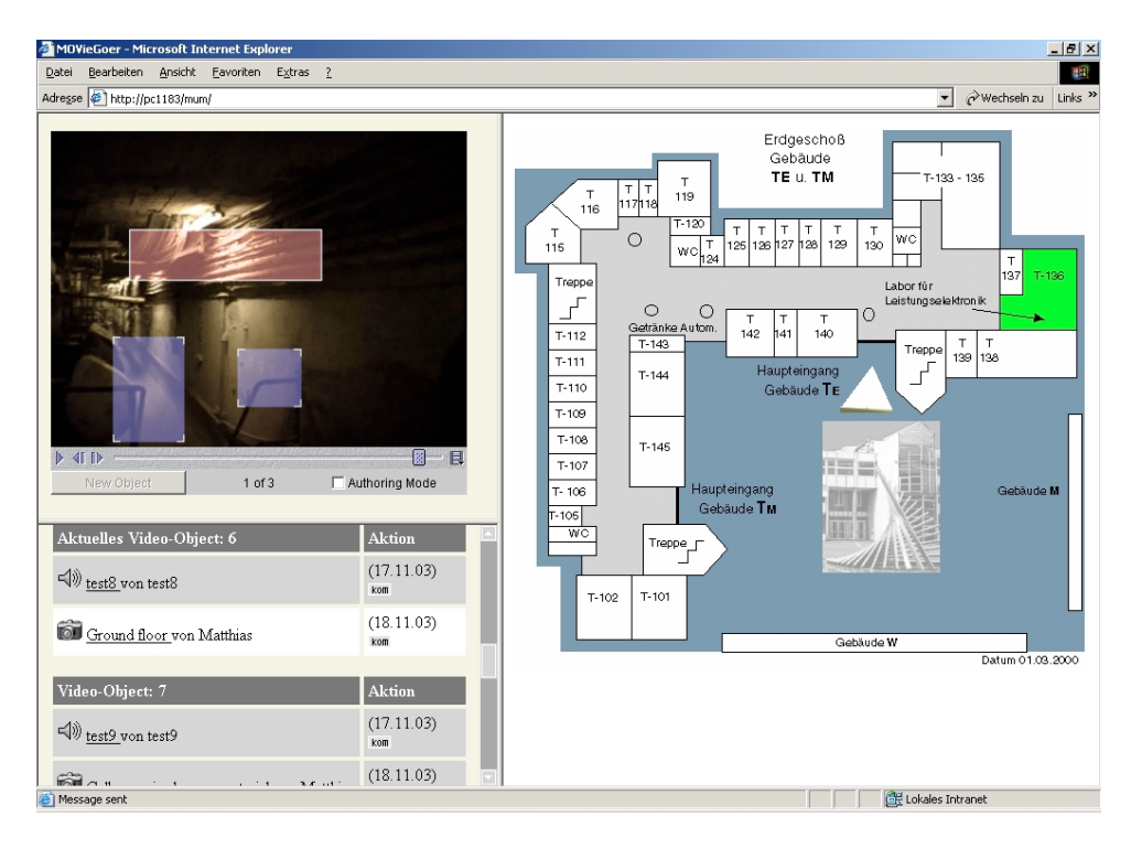
Figure 2: Graphical user interface of HyperVideo

Hypervideo authoring has been discussed repeatedly as an opportunity for performing collaborative hypervideo design projects in educational contexts (Chambel, Zahn & Finke, 2004; Zahn, Schwan & Barquero, 2002). Additionally, the new technology was evaluated and further developed during three psychology courses at the University of Muenster/Germany. These courses were planned according to an instructional program based on courses of hypertext writing, developed by Stahl and Bromme (2004) on the basis of models on text writing (e.g., Bereiter & Scardamalia, 1987). The course concept aims at utilizing central features of hypervideo design as constraints that foster knowledge transformation in learners (Stahl, Zahn, Schwan & Finke, submitted; Stahl, Zahn & Finke, submitted). The concept also aims at controlling basic influencing factors that were identified earlier by Stahl (2001) in the context of hypertext design tasks at school. These factors are of essential importance for our present purposes, as will be described in the following section.