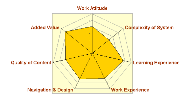
Figure 2. The added value of DIOGENE

was appreciated from tutors that DIOGENE allows a mechanism that supports collaboration with learners and that enables tutors to support the learning process. Skill searchers confirmed the value of the services related to skills requests in the process of higher qualification and/or recruitment. According to the innovative aspects that can be associated with DIOGENE, evaluators assessed DIOGENE to be a highly innovative (63 % of evaluators) and highly useful (94 % of evaluators) system that provides easy to use and good quality (91 % of evaluators) services of which they would want to make use again once DIOGENE will be available as a commercial service (87 % of evaluators). It was also clearly found out that where constant communication and interaction between the stakeholders of the VO was held, learning outcomes and progress could be improved and processes made easier as well as more transparent to stakeholders. Figure 2 shows some evaluation criteria on which DIOGENE had been evaluated.