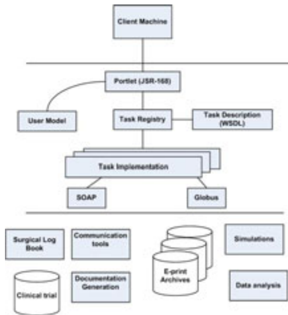
FIGURE 3 OVERVIEW OF THE PROPOSED INFRASTRUCTURE

The CORE project will develop a VRE demonstrator based on a SOA for supporting all of these activities. The advantages of using a SOA are: