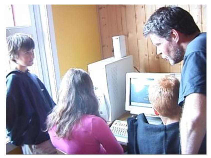
Picture 2: A collaborative setting where students and teacher are gathered in front of the LAVA-learning environment.