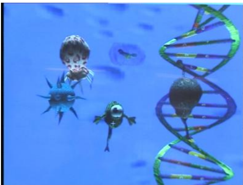
Picture 3: Students and their teacher in microcosm about to sequence the gene structure.

The task starts in what we have called macrocosm, a specialised laboratory or the so-called sequence lab. Here there is an entrance into what we have called microcosms where the participants, represented as odd avatars, are able to participate in activities at a cell level. The students have previously solved different tasks on what part of the DNA structure looks like (a gene), what its basic units are (pairs of bases) and how these are related (A and T, C and G). We enter into the data where, as we will argue, the students are about to understand how they are going to sequence the gene structure (read from the bottom to the top and along one of the sides of the gene structure) and find out how to close the task (compare the reading with three sequences they find at the web adjusted to their problem solving and decide which of these that are similar). Information about how to sequence is explicitly expressed in the given task.