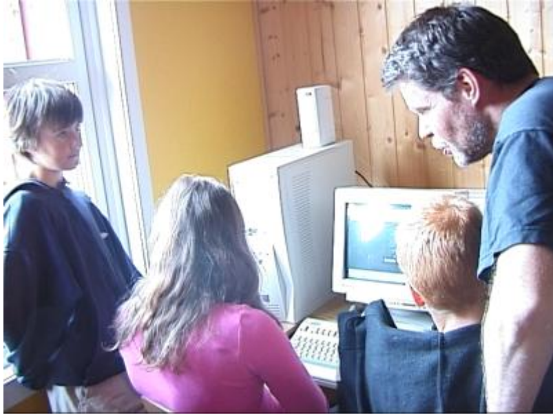
Picture 2: A collaborative setting where students and teacher are gathered in front of the LAVA-learning environment.