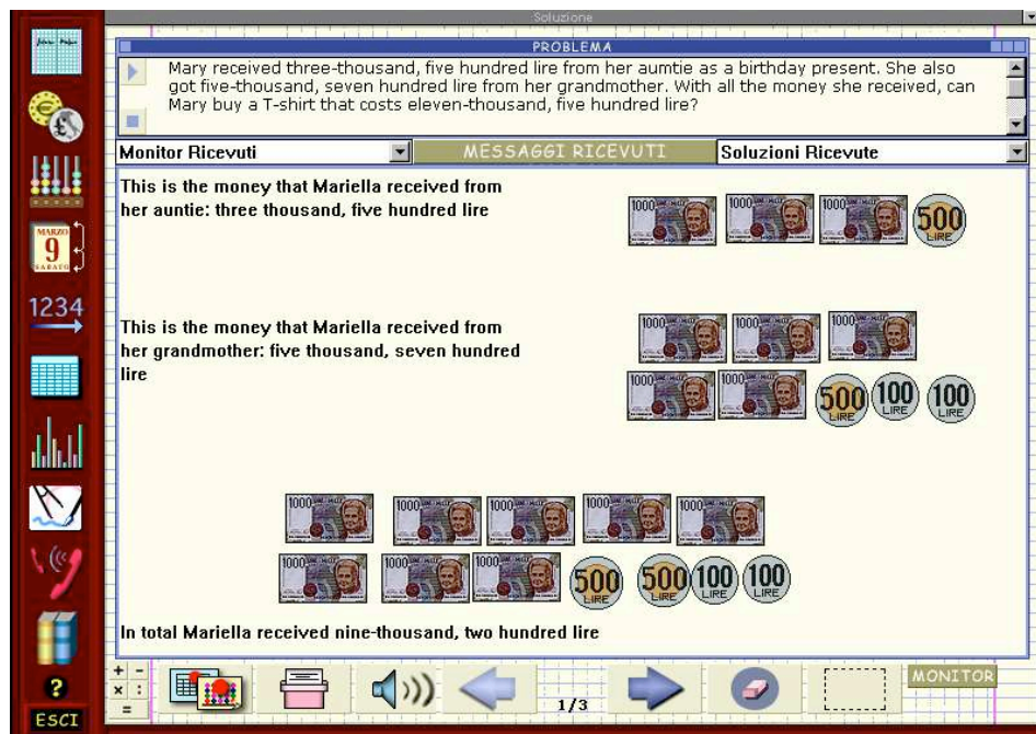
Fig. 3: Interface of the ARI-LAB Solution Sheet