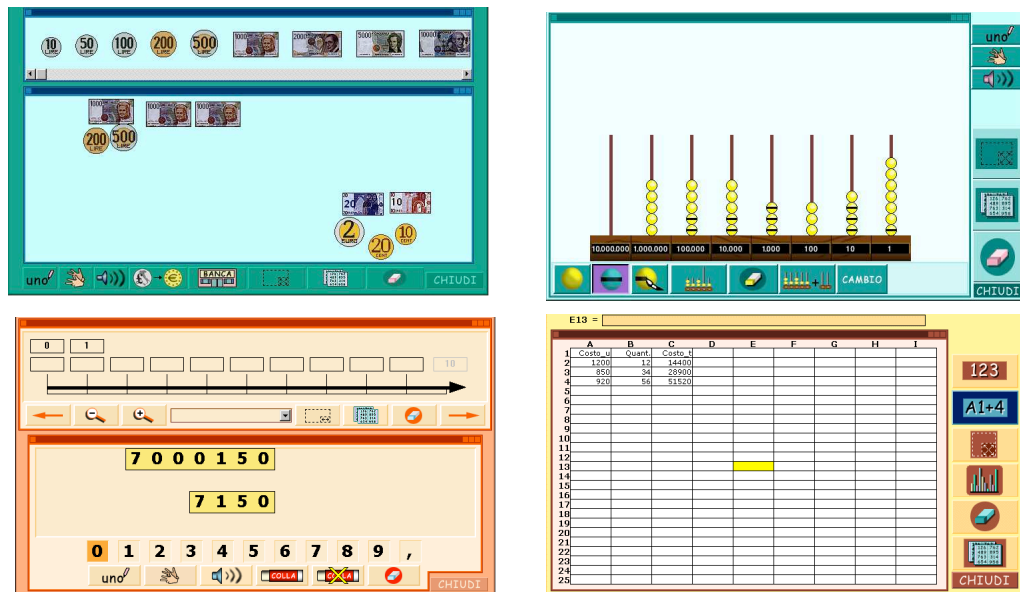
Fig.2: Interfaces of the Coin, Abacus, Number Building and Simplified spreadsheet Microworlds

user employs verbal language and arithmetic symbolism to comment on the visual representations copied and thus to explain the solution performed. From the solution sheet it is possible at any time to access the microworlds and also the other environments (e.g. the Communication environment) the systems is composed of.