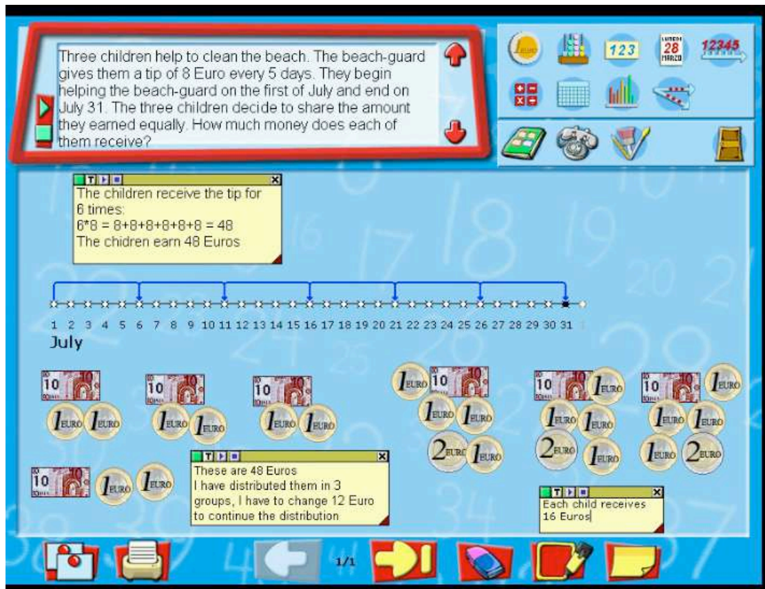
Figure 2: Interface of the Solution Sheet environment with an example of a problem solution