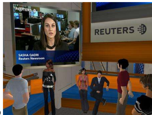
Fig. 3 a) Virtual visiting of the Washington Monument [14]; b) Reuter's virtual news bureau [3]

One interesting aspect of several of these worlds is that they give their users tools that allow them to change the virtual world itself: editing tools (see Fig. 4). Virtual Worlds can, this way, be built from the ground up and developed by its users (players). It is even possible for users have property rights over virtual objects they create, as is the case of Second Life.