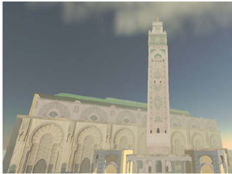
Fig. 2 The Global Outreach Morocco project brought students with backgrounds in technology, business, and hospitality together to study economic development in Morocco through the growth of the travel and tourism industry. Students used Second Life as an education tool to develop specific locations, such as this Hassan II mosque [13].