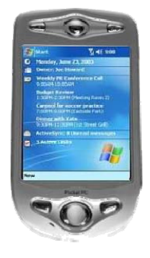
Figure 1. XDA II clone PDA

The models used in the study included Qtek 2020, Qtek 2020i, i-mate, XDA II and XDA IIi, almost identical hardware (shown in Figure 1) running Pocket PC 2003. The PDAs were supplied with aluminium protective cases and screen protectors. Separate collapsible Stowaway keyboards were provided where the participant requested one.