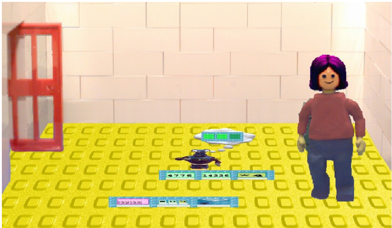
Figure 1: The ToonTalk programming environment. The programmer's avatar is on the right, and a robot generating a sequence of numbers in the centre.

ToonTalk (Figure 1) is a language and a programming environment designed to be accessible by children of a wide range of ages, without compromising computational and expressive power. Following a video game metaphor, the programmer is represented by an avatar that acts in a virtual world. Through this avatar the programmer can operate on objects in this world, or can train a robot to do so. Training a robot is the ToonTalk equivalent of programming. The programmer leads the robot through a sequence of actions, and the robot will then repeat these actions whenever presented with the right conditions. ToonTalk programmes are animated: the robot displays its actions as it executes them.