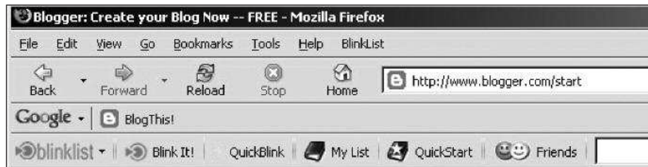
BlogThis! and Blink It! tools

Clipping tools are a compliment to tagging tools. A clipping tool sits on the toolbar of your browser and allows you to either clip the resource you are viewing and add it to your blog and/or add it to your social bookmarks. Whichever way you choose, clipping tools allow you to add annotation to information that you have found and want to keep a reference to, and then to share this information and your added value-tags and annotation with others. Two tools that are available for this kind of activity are BlinkIt and BlogThis. These kinds of activity are relatively new and are clearly under-researched; however the criticisms of social bookmarking would also apply here.