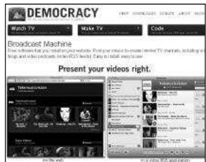
Broadcast Machine at www.getdemocracy.com