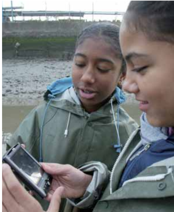
Mudlarking in Deptford trials

This section outlines some of the main reasons for taking learner voice seriously.