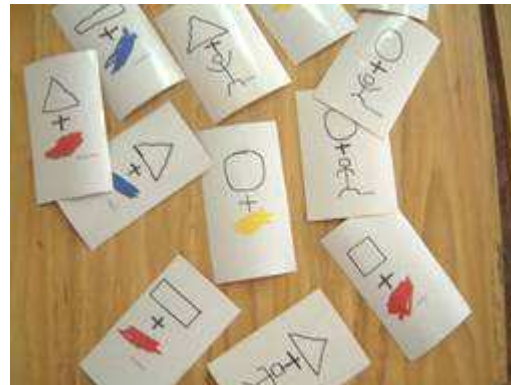
Figure 7 - Final cards

The logic blocks' pieces were scattered over a grid carpet. The children had to interpret the cards' meaning – the attributes had been randomly sampled – and then command the robot, programming it, until the matching piece was found (figure 8).