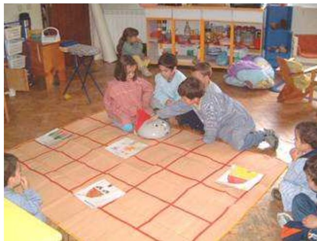
Figure 5 - Children operating the robot

With this setting, Little Red Riding Hood (the Roamer robot) should take the path from its home to grandma's (math domain), going through the story events. During the retelling experience (drama and music domains: the children that wanted to watch a child operating the robot had to sing the Little Red Riding Hood song), by operating the robot, the children had to employ the notions of left/right, direction (forward/back), and quantity, to mention a few. In doing so, they were also developing a strategy to reach their goal (figure 5).