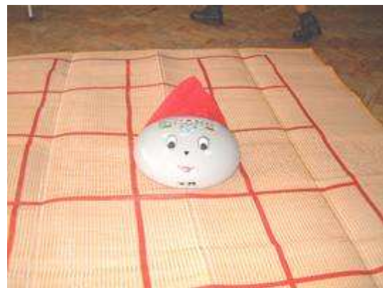
Figure 4 - Little Red Riding Hood

With this setting, Little Red Riding Hood (the Roamer robot) should take the path from its home to grandma's (math domain), going through the story events. During the retelling experience (drama and music domains: the children that wanted to watch a child operating the robot had to sing the Little Red Riding Hood song), by operating the robot, the children had to employ the notions of left/right, direction (forward/back), and quantity, to mention a few. In doing so, they were also developing a strategy to reach their goal (figure 5).