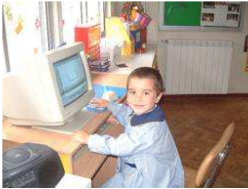
Figure 6 - Child drawing the cards at the computer