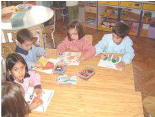
Figure 3 - Drawing the story

domain). Afterwards, the robot was disguised as Little Red Riding Hood, result is shown on figure 4 (plastic expression and drama domains).