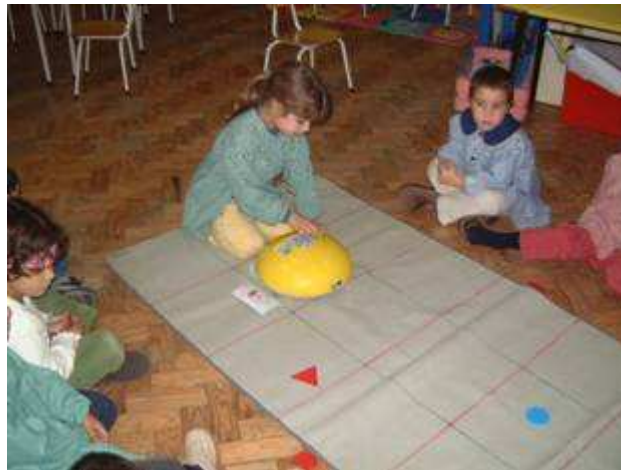
Figure 8 - Children commanding the robot

The logic blocks' pieces were scattered over a grid carpet. The children had to interpret the cards' meaning – the attributes had been randomly sampled – and then command the robot, programming it, until the matching piece was found (figure 8).