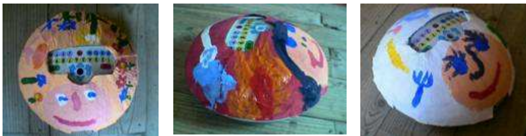
Figure 1 –Roamer robot in disguise: flower seller, firewoman and chef, for the “Professions” room project

The Roamer robot was created by Professor Tom Stonier (Goodman, 1999) at the UK. It is an autonomous, programmable toy, 40cm wide (figure 1). Its "shell" can be removed and customized, in effect acting as a "disguise" or Carnival costume. This ability is both motivational and an important element to fulfil the various individual and group projects of kindergarten rooms.