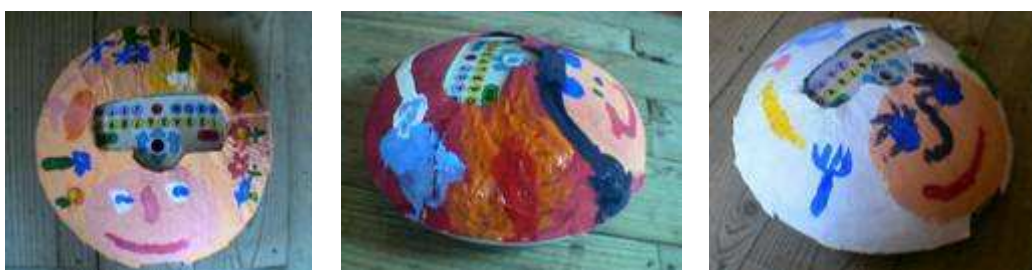
Figure 1 –Roamer robot in disguise: flower seller, firewoman and chef, for the “Professions” room project

The Roamer robot was created by Professor Tom Stonier (Goodman, 1999) at the UK. It is an autonomous, programmable toy, 40cm wide (figure 1). Its “shell” can be removed and customized, in effect acting as a “disguise” or Carnival costume. This ability is both motivational and an important element to fulfil the various individual and group projects of kindergarten rooms.