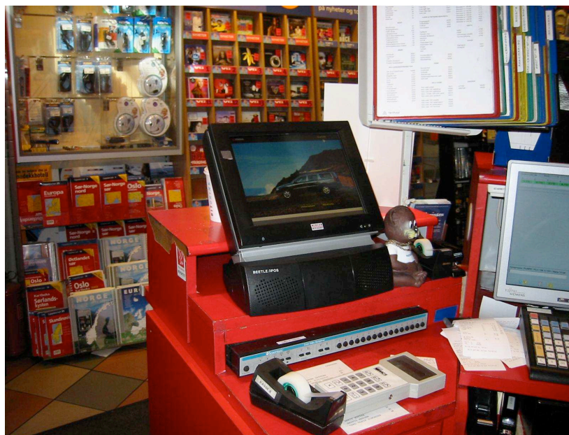
Figure 3: First prototype (touch screen) created by the IT-department based on the mock-ups created in the design workshop. It is located next to the cash register, facing the attendant.

The ServiceCompany's IT department created the first computer-based prototype based on one of the refined mock-ups. This prototype was a touch screen-mounted terminal facing the attendant and placed in a pilot station for a period of two months (Figure 3). The system contained product information about car batteries and windshield wipers. During the trial period, all employees at the gas station explored the prototype's features at least once. They were eager to tell us what they thought about it and how it could be improved. The feedback we received gave us the impression that the employees really needed detailed information about automobile products in their daily work. They were enthusiastic about having a computer tool that could supply this information.