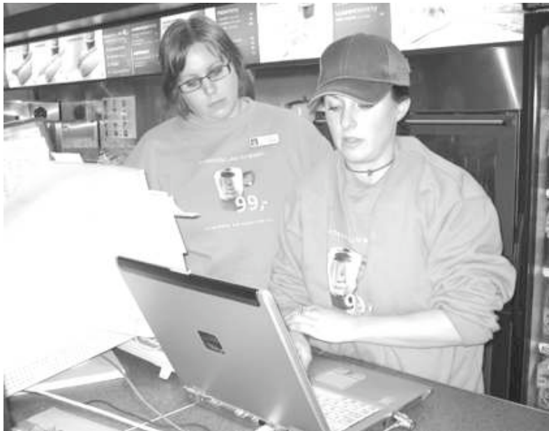
Figure 5: Third prototype (laptop interface) created by the IT-department in response to demands for integration with the company's intranet portal.

The third prototype has been in continual but sporadic use since 12/2003. The user interface and product database have been improved and the system was installed at 22 new gas stations during the summer of 2004.