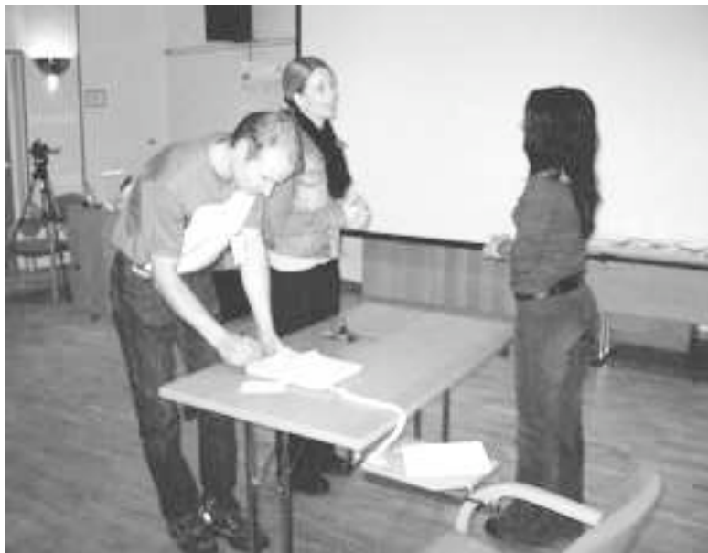
Figure 2: Playing a work-oriented script with the aid of a mock-up to resolve a breakdown (customer waiting in line is helping himself by consulting an information display).

We hired a professional theatre instructor to give the participants an introduction to dramaturgy for the purpose of role playing. This started with a ‘warm up’ exercise supplemented with guidelines for how to create work-oriented scripts. The scripts were later played in two sessions (Figure 2 shows a scene in session 2). The first session was to simulate the current work situation, and the audience was told to identify potential breakdowns that could occur (e.g. someone pumping gas and leaving without paying), and write them down as comments on 4x6 index cards. The theatre instructor incorporated a selected set of these as prompts in the second round of role playing.