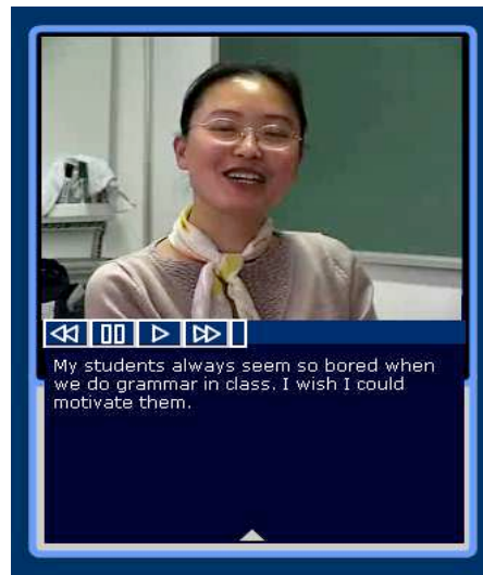
Figure 3: The Interactive Movie Player

In the IMP the learner is presented with the video/audio to play and can select to reveal the transcript underneath the video; presented as short clips shown synchronously with the audio. Full transcripts are made available as pdf files. In depth piloting of the online materials in China that made extensive use of this IMP found that the video presence of the ‘author’ was an important motivator for these learners (Joyes & Zehang, 2005) without them they would be less likely to study the materials in depth. Thus consideration of modality effects becomes less important when the whole context for learning is considered and the technologists have to rely upon the academics to interpret this for them. Notions of ‘rules’ for learning design suggested by Ginns, (2005) in the quote above need to be questioned in the light of the need to consider the wider pedagogic context in which learning is to occur.