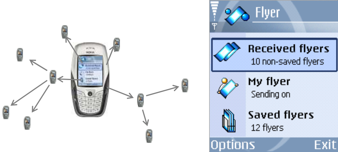
Figure 5: Nokia Flier Software

software (Figure 5). The Nokia Flier application allowed participants to create and locally distribute short messages containing text and a picture. Nokia Flier used Bluetooth technology for communicating with other phones. The software used was not designed for learning purposes, thus the design of the interface was modified and improved for this collaborative learning scenario. Specifically, it was adapted by creating template fliers, which included sentence openers for phases where participants' when creating and evaluating fliers.