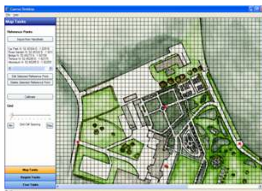
Figure 4: CAERUS desktop application

CAERUS also includes a desktop application, illustrated in Figure 4, to administer the location-based content. Maps in any image format can be imported into the desktop application and calibrated. Once calibrated, the administrator can define regions of interest and associate them with thematically-organised multimedia content. The system supports both free exploration and ‘guided’ tours, where the next region of interest is suggested to the visitor. The handheld and desktop applications communicate through a standard synchronisation procedure.