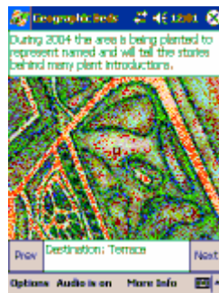
Figure 3: CAERUS handheld application

presented automatically exactly where it is relevant. Learners can then select to view additional multimedia content for that particular location or continue with their exploration or tour.