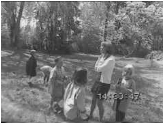
Figure 3. Narrative activity without Pogo. Exploration (fig. a,b): children explore the garden and collect material for a narrative activity. Inspiration (fig. c): some examples of children reports on the Observation Notebook. Production (fig. d, e): while children work individually, the teacher passes through the tables and helps them to structure the content in a narrative form. Sharing (fig. f, g): teacher reads the stories produced by each child and shows the illustrations.

Narrative activities involve complex organization where the child is guided by the teacher. We have broken down this process into four stages: Exploration, Inspiration, Production and Sharing (fig.3).