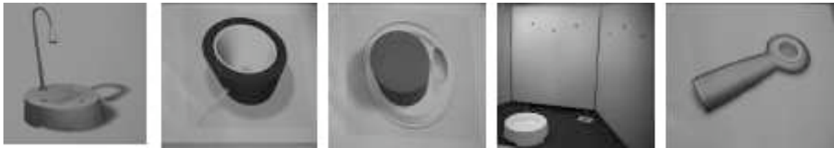
The Pogo tools: Beamer (a), Basket (b), Token (c), Screen (d) and Torch (e).

Five instruments (fig. 1) make up the first generation of Pogo. The Beamer is a threshold tool, which connects the real and the virtual environment by allowing the passage (storage) of physical things into the virtual story world. It is a base unit integrating a video camera laid over a Basket and a card reader. The Beamer allows the real-time projection (on the Screen ) of any kind of physical object placed in the basin. Children can also place their body under the camera and have their hands or face projected on the Screen . The combined use of Beamer and cards allows users to capture and store (on the cards) the physical objects placed in the basin.