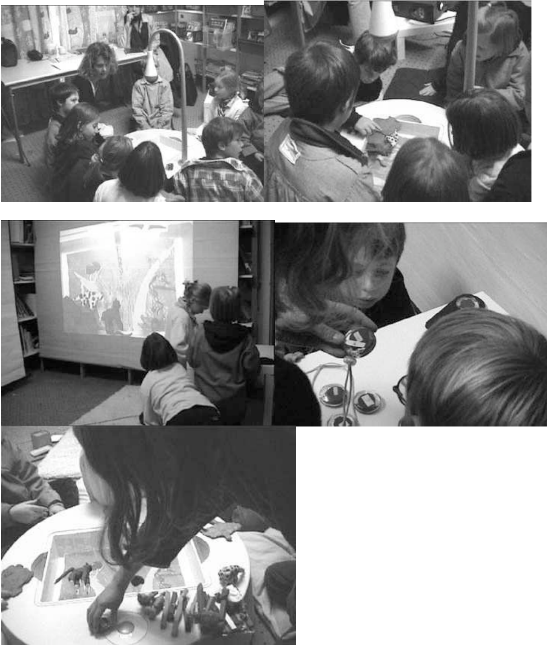
Figure 8. Production with Pogo. After creating a text orally (fig. a), children build its graphical representation (fig. b , c), record the scene on a token (fig.d) and the label it (fig. e).

an illustrated book. The metaphor of the book, which seems to have been proposed by the teacher, is even more strikingly evident during the Sharing Phase. The transition from one illustration to the next guides the narrative, just as though the children were paging through an illustrated book, and telling the story as they looked at the pictures.