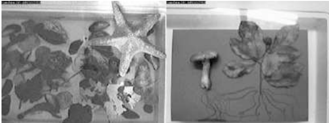
Figure 6. Exploration with Pogo. Use o the Beamer of seashells (fig.a), mushroom and leaves (fig.b) respectively in the “Goldfishes in the sea” and “Mushroom development” activities.

Exploration. Pogo instruments do not affect this exploration phase. Even if proposed during the activity, Pogo instruments are not used by the teachers. The teachers feel that “the Exploration Phase does not need Pogo instruments”, because nothing can replace direct, unmediated experience for entering into contact with one’s environment. Nevertheless, the Beamer, which enables the user to import a virtual version of various sorts of objects, would stimulate both child and teacher to make a record of a direct, unmediated experience. Teachers encouraged the children to tell their stories by using the Beamer, and projecting images onto the Screen (seashells gathered on the beach in fig. 6a and mushrooms gathered in the woods in fig. 6b). In conventional activities, they could only reproduce these objects in the form of a drawing.