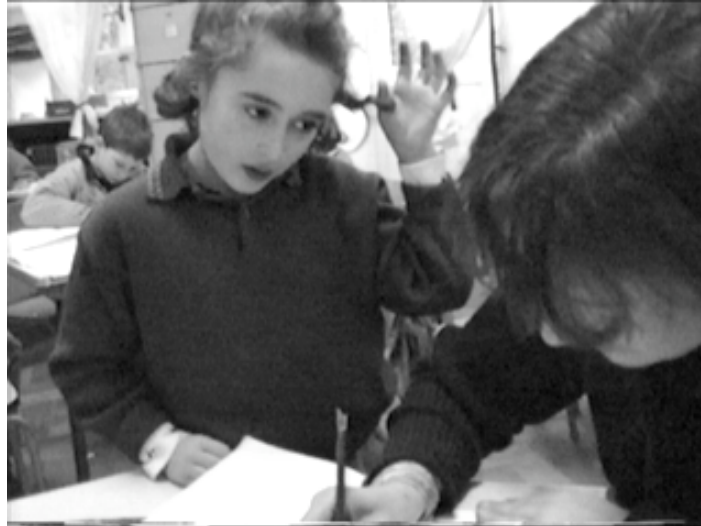
Figure 4. Individual /group dimension without Pogo. The teacher encourages and questions the child and transcribes the story in the Rough Draft Notebook (a). The child copies the story from the Rough Draft Notebook in the Story Notebook (b) and draws an illustration (c).

The graphic illustration of the story is also done individually, during or after the verbal description (fig. 4 c). In other words, in conventional activities story making is mainly an individual undertaking.