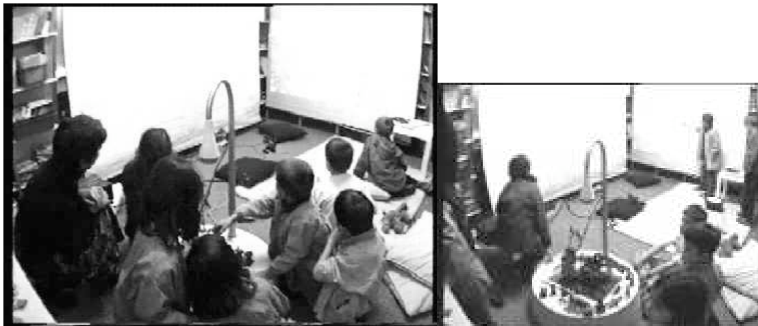
Figure 11. Scenes creation : children form a semicircle around the beamer facing the Screen at a distance that allows them to visualize the whole Screen and to check the result of their production before recording. Some children are also standing up nearby the screen pointing elements and calling the children attention on specific contents.

Each of these three configurations has a particular function in the Pogo space, depending on the task being performed by the children. According to the teachers, this variety of configurations and the mobility implied are not compatible with the conventional arrangement of desks in the class. We therefore conclude that the current spatial arrangements required for working with Pogo instruments apparently implies the need for a dedicated area for Pogo.