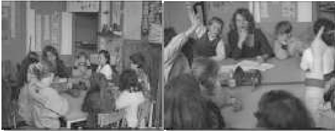
Figure 5. Spaces and physical settings

the teachers like to rearrange the children's desks (provided room size is suitable), turning the desks so they face one another and thereby facilitate communication between the children.