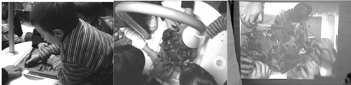
Figure 7. Inspiration with Pogo. During the “Mushroom development” activity, the Beamer is used as a support for drawing (fig. a) and for experimenting various compositions (fig. b). The screen allows to monitor the results (fig. c).

activity “Mushroom Development”, where the children spend nearly all the Pogo session in the Inspiration Phase. The children gather around the Beamer and the teacher encourages them to use the material placed at their disposition to reconstruct the developmental phases of the mushroom. The Beamer acts as a support for handling the material, and for producing a drawing (fig. 7a). The teacher encourages each child, in turn, to suggest ideas by modifying the way the material is laid out on the Beamer table (fig. 7b). The Screen enables them to monitor their own production, as well as the productions of other children (fig.7c), and becomes a support for their discussion and group decisions.