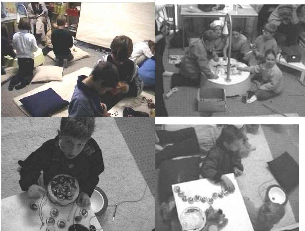
Figure 9. Individual/group dimension with Pogo. Children are distributed in the classroom’s space (fig. a). While some of them create the story content with the Beamer (fig. b), others take care of labelling and ordering the tokens (fig. c, d).

Effects of role diversification. During the evaluation we observed a division of labor during the creation of scenes, namely “producers of contents” and “technicians”: certain children produced the story line (fig. 9a and 9b), whereas others were mainly occupied with the use of Pogo instruments (fig. 9c to 9d), although the roles did change. The participation of the first group is the core of activity aimed at producing the story, and the second, more technical component is both active and oriented towards implementing the activity. This diversification during creation can be explained by the distribution of the instrument functions: the Beamer is the only instrument that can be used to create content, whereas the other instruments serve to memorize (Tokens) or reproduce (Basket, Torch and Screen) the results achieved with the Beamer. In addition, we noted that the sequential organization of the scenes requires a special sort of investment. Since the content of the Tokens is not easy to read, external media must be used to keep track of their order. The Tokens are labeled with stickers and checked using the Basket. The complexity of the operations involved in memorizing the sequences encourages some children to occupy themselves continuously and exclusively with this task, thereby becoming technicians.