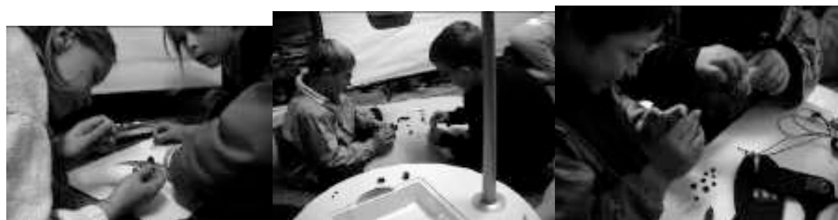
Figure 10 (a, b,c). Spaces and physical settings. The children are divided in spaces in several groups according to the elements they have to construct.

While the Pogo environment is designed to be integrated into normal practices and the normal environment of the school, the initial reaction of the teachers was to view Pogo spatially as a sort of laboratory functionally separated from the normal classroom. This reaction can be attributed mainly to transitory limitations connected with the difficulty of moving the Pogo system around, and the space occupied by the components, which makes it difficult to integrate the system into a normal classroom. Another, more profound, explanation is related to the important changes in the use of space: the introduction of Pogo implies extensive revamping of normal school practices. Further explanation of this aspect can be found below. During the testing period, we observed that the spatial arrangement of the tools and the children was radically different than found in a normal classroom (fig. 10).