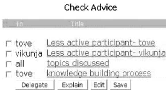
Figure 5. Assistant presents advice to the teacher

advice should be sent and "all" means to all students. The title column shows the title of the advice, and it is also the title of the email if the advice is decided to be sent to the student. In Figure 5, if the teacher clicks on the link title "knowledge building process" to student "tove", he/she will see a window pop up and it contains that content of the advice: