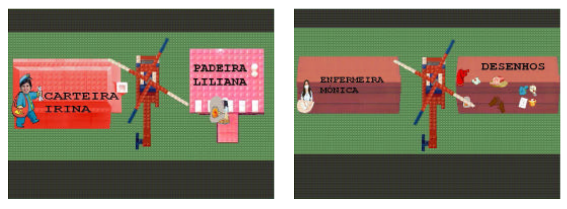
Figure 2 - City with houses for three professionals (plus a "pictures" house)

The combination of the two previous ideas is that the computer can be both the destination of an off-computer activity and a source of materials for off-computer activities. But this means that the computer can be entirely involved in an activity, rather than being an "extra" part of it.