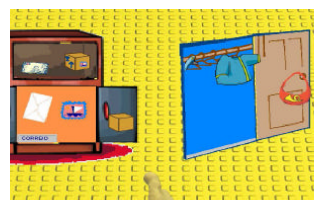
Figure 3 - Postwoman's items and uniform