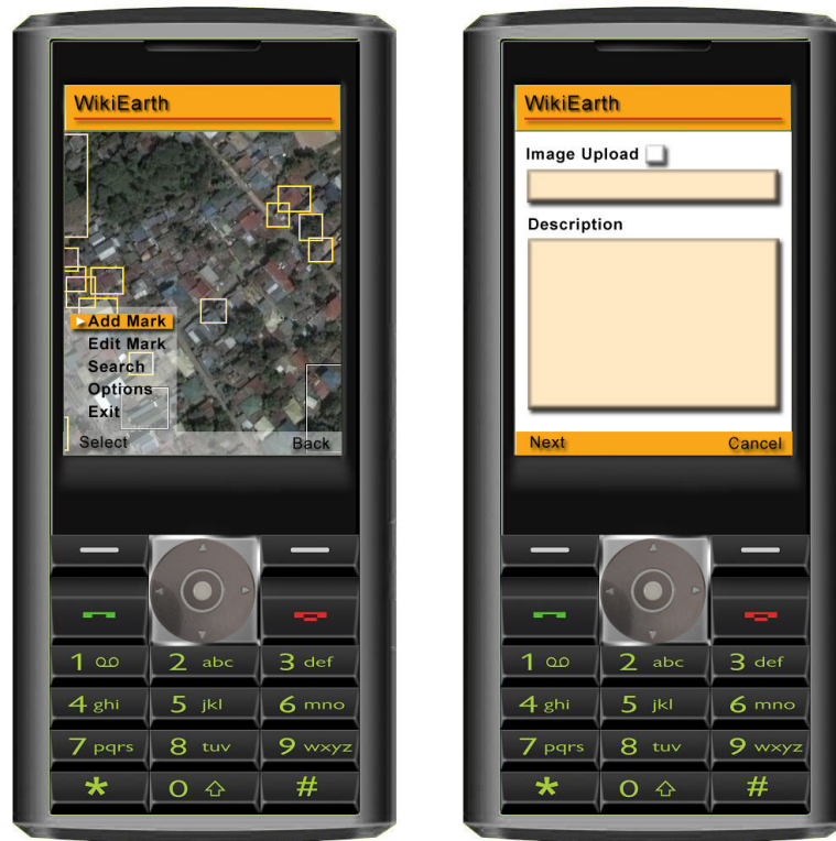
Figure 2: Mock-up examples, with the proposed front-end interface

The interface should respond to the features of the mobile device employed by the user, in order to ensure that it can run on various devices with different levels of hardware resources. The minimum equipment requirements for the front-end interface should be: ability to connect to the Internet and/or use SMS; and have enough display resolution for presenting maps. In order for the operation of wiki and map servers to be independent of actual mobile devices, an interposing software layer must be developed (“Interface Layer”), with components adapted to each kind of device. Its function is to convert requests native to each device into generic request, which will then be interpreted by the servers. We also propose that data communication between all system components is performed, as much as possible, with standard XML-encoded data.