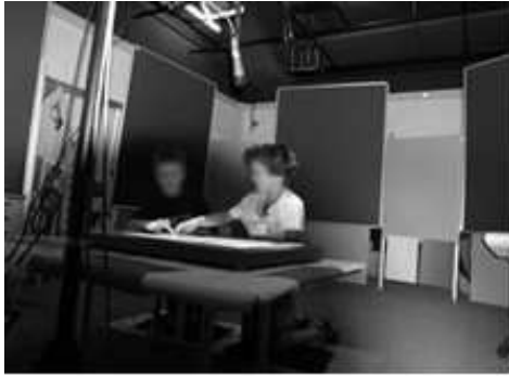
Figure 2. Children interacting with the StoryTable