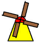
Figure 2: Windmill

to propeller setPW 2 setFC "taupe5 repeat 4 [fd 53 bk 43 polygon [repeat 2 [fd 40 rt 90 fd 10 rt 90]] bk 10 rt 90] end