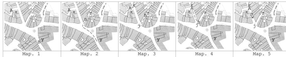
Fig. 1: Map references used in the transcript at Table 1

If we try to model the described situation using Clark and Shafer's Contribution Model 1989 [5], or Traum's Grounding Acts Model 1999 [24], we reach the conclusion that A and B have grounded their conversation at each acknowledgment. More precisely: once both presentation and acceptance phases have been completed, the peers will have grounded a certain contribution (at utterance n. 4, 7, 9, 11). There is the tendency in CSCL to correlate the rate of acknowledgments with the level of shared understanding on the assumption that the provision of evidences of reception is enough to infer the understanding of the signal and the corresponding incorporation in the contributor's beliefs. Additionally, when using these models, it is difficult to operationalise a lack of understanding, as in the example provided when B leads to point "z", because B provided clearly evidence of acceptance as per message 4, on Table 1.