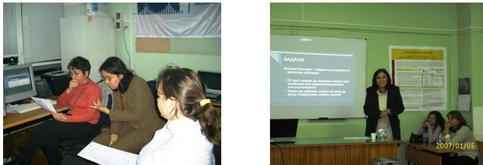
FIGURE 2. Careful scenario design leads to promising results!

The topic School Outdoors was chosen for the first group of in-service teachers. The teachers' teams worked on organizing "green" and "blue" schools, discussed the street and the home as a place for learning. One of the most attractive subtopics was "Why Knot"? Making a parallel with "Why not?" question and treating knots as a communication media the knotty subtopic tied up all other subtopics together.