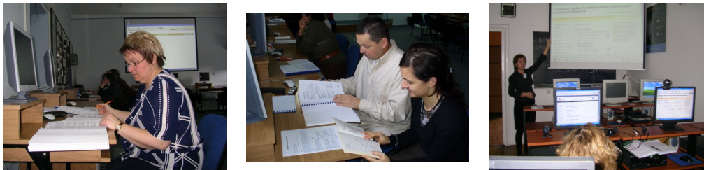
FIGURE 1. Minutes from teachers training courses in Poland

At the end of the training the participants wrote didactical scenarios employing the I*Teach methodology in which they considered the soft skills that were discussed during the training. The scenarios were then presented at the I*Teach Innovative Teacher platform of the University in Iasi (Romania) as well as at the platform of the Faculty of Chemical Education at UAM in Poznań (Poland) which makes them available to teachers from many other countries. Within the project our teachers carried out classes based on these scenarios.