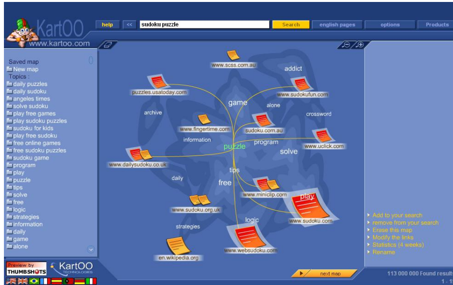
FIGURE 1. SCREENSHOT FROM THE TASK3 (SEARCH RESULTS WITH THE KEYWORD SUDOKU)