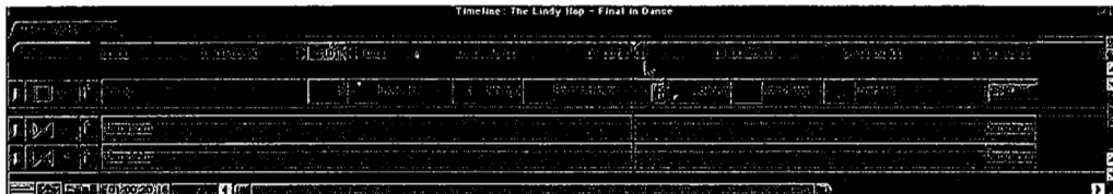
Figure 27.2. A typical time line. This example is taken from Apple Final Cut Pro. The position locator is represented by the long vertical line and yellow arrowhead near the center.

Multichannel video editing is also on the horizon not only as a new art and media form, but as a legitimate tool for presentation of multiple video channels; there is a relevance to studying distributed learning with video capture of interactions at each node of collaboration. Commercial editing tools have principally been developed for creating single-channel programs, for example, a linear film or video with one image stream accompanied by simultaneous audio in mono, stereo, or multiphonic variants. Although the semiprofessional and professional systems are capable of multiple video and audio tracks, these are intended as intermediary steps in creating the single-channel master. Layered video tracks are intended for creating composites, keys, and other image effects that will ultimately be reduced to one image track via rendering. The multiple audio tracks are likewise an aid in working with different sound elements such as speech, sound effects, and music that will be mixed down to the finished stereo audio